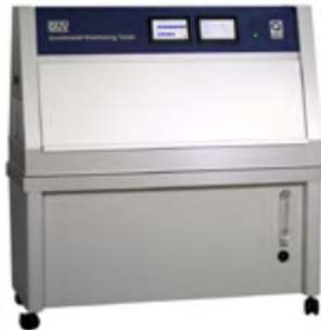
The QUV is the world's most widely-used weathering tester.