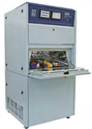
The Q-SUN's full-spectrum xenon arc lamps emit UV, visible light and infrared.

Obviously, it is logically meaningless to talk about a conversion factor between hours of accelerated weathering and months of outdoor exposure. One is a constant condition, whereas the other is variable. Looking for a conversion factor requires pushing the data beyond the limits of its validity.