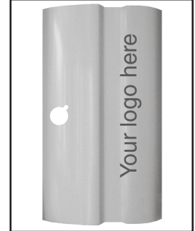
Panels can be customized in dozens of different ways, such as adding your company's logo.