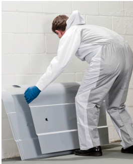
The Q-PANEL automotive refinishing training system is a cost-effective simulation of hoods and fenders.

These custom panels are most cost-effective when there are quantities sufficient to allow an economical production run, and when the material is available from our stock metal or readily available alloys. Contact Q-Lab with your custom panel specifications now!