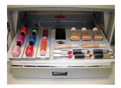
Bottles and other oddly-shaped samples can be easily tested in a Q-SUN chamber due to its flat specimen tray and variety of mounting options.

Under the ICH Guidelines, it is perfectly acceptable to expose specimens to higher dosages in either range. In fact, light sources that meet the D65 or ID65 definition will achieve the visible light energy dosage well before the ultraviolet energy dosage. Therefore, a D65 or ID65 light source will create an "overexposure" of uv energy upon completion of the test.