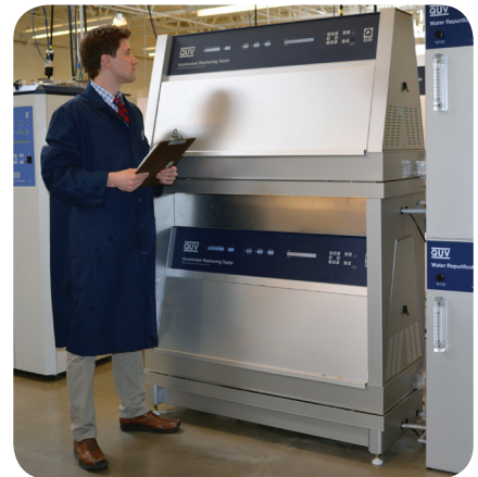
Stacking testers on the space saver frame allows easy access to both machines.