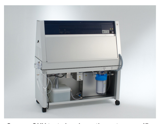
On new QUV test chambers, the water repurification system is integrated directly into the tester.

Unlike competing systems that simply recirculate dirty water, Q-Lab's repurification system repurifies water in addition to conserving it. Major components include: a water reservoir, a pump, a flow adjustment valve, a repurification cartridge and a Total Dissolved Solids (TDS) purity monitor.